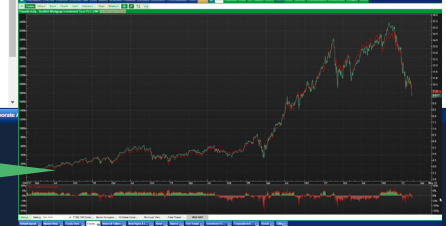
Chart investment trusts with NAV